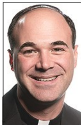
BY THE RIVERS OF BABYLON

I like to fix things. For me, it is an absolute thrill to take something which is broken, damaged or worn out and bring it back to life. I suppose that I learned how to do this when I was very young since I come from a long line of "fixers." The example given to me by my father and my grandfather of mending, fixing and restoring broken things has stayed with me to this very day.