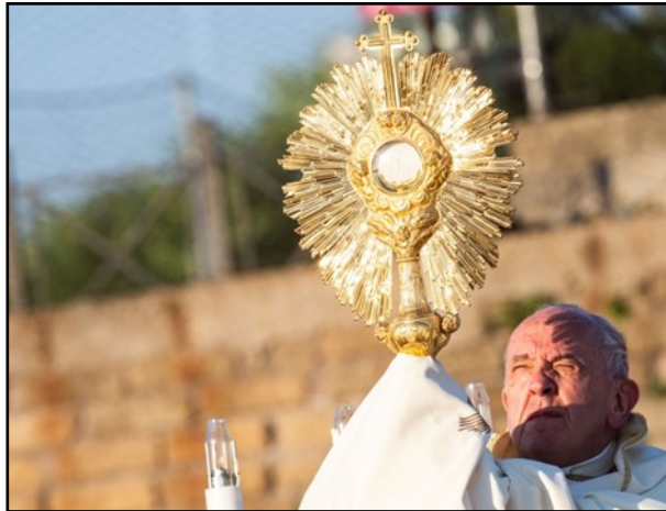
Pope Francis offering Eucharistic Benediction at the end of the Corpus Christi Procession on June 23, 2019

There will be only one Mass on the morning of Sunday, June 11. It will be at St. Gregory Church at 9:00 AM.